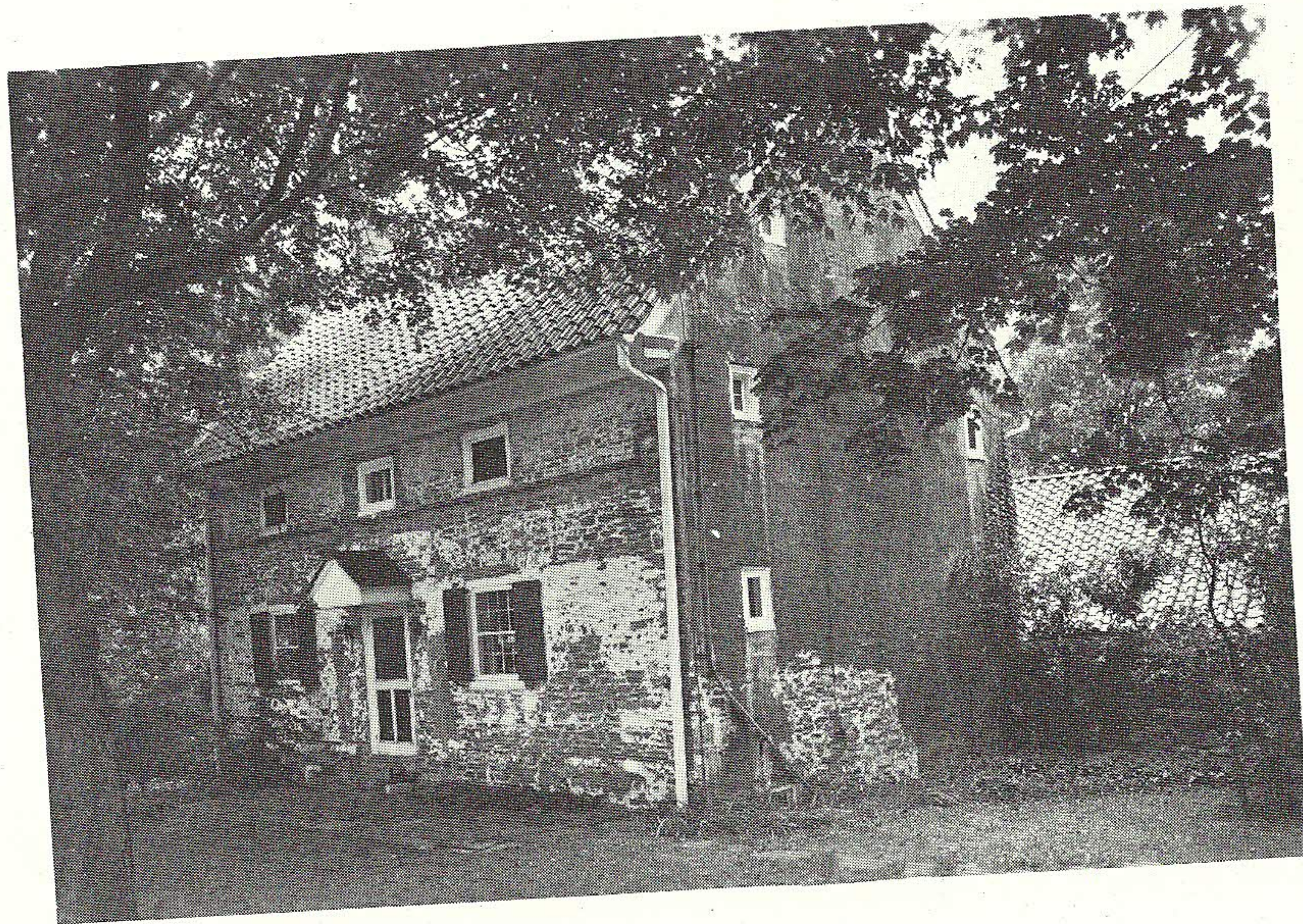
South front and east side

Originally, there was a stairway in both the east and west walls. The ceilings of the first and second story originally were plastered. The house never had baseboards. The summer beam extended below the plaster level. Sometime during the eighteenth century, a wing was added to the north which included a large cooking fireplace, and during the twentieth century, a number of partitions in the house were changed. The tile roof was put on in 1910.