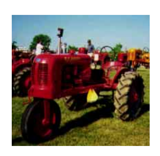
Tractor made at B.F. Avery

He was then made Section production Foreman in the machine shop until June 1, 1952.